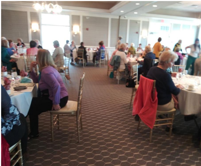
Lisa Genova "Remember – "The Science of Memory And the Art of Forgetting" – April 13, 2021 Luncheon