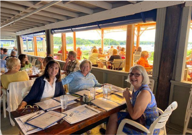
Great Time at Lunch Bunch at the Chart Room in Cataumet - July 22, 2021

Lunch Bunch – Casual get-togethers at various restaurants throughout Upper and Mid Cape areas Join Us by contacting Susan Creed