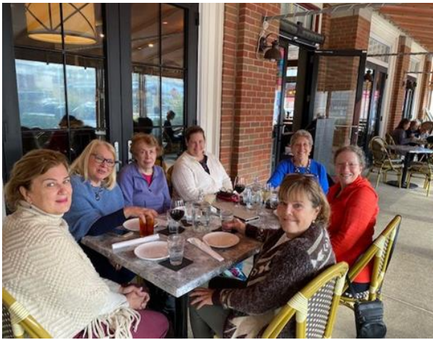
November Ladies' Lunch at Trevi in Mashpee