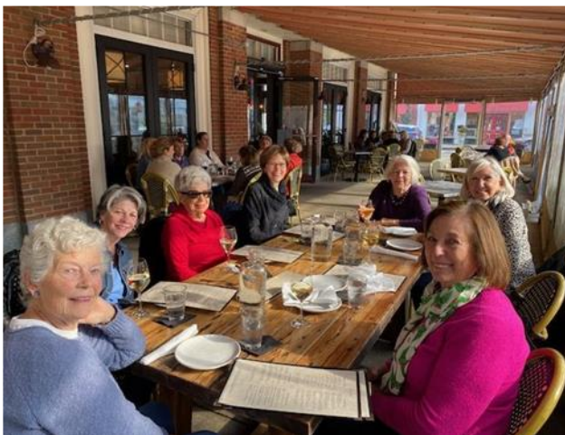
November Ladies' Lunch at Trevi in Mashpee