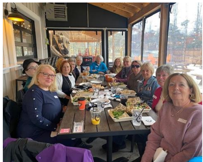
April Ladies' Lunch at Cape Cod Coffee, Rte 130