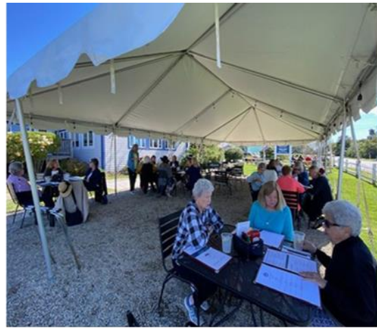
Ladies' Lunch enjoying an afternoon at the The Pilot House in Sandwich