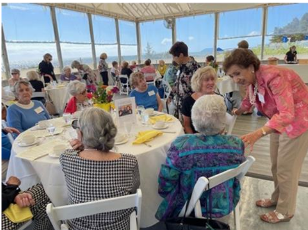
Luncheon at Popponesset Inn