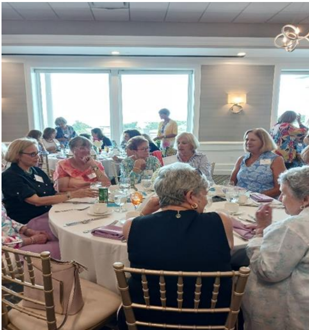
MWC Luncheon at New Seabury Country Club