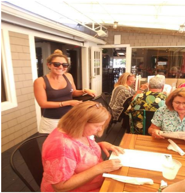
Lunch Bunch @ Pier 37, Falmouth