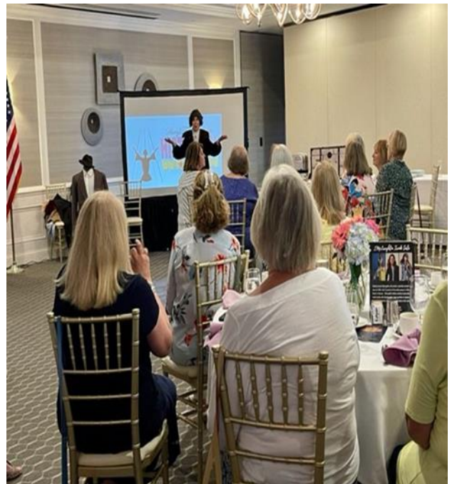
August Luncheon with 'Eleanor Roosevelt'