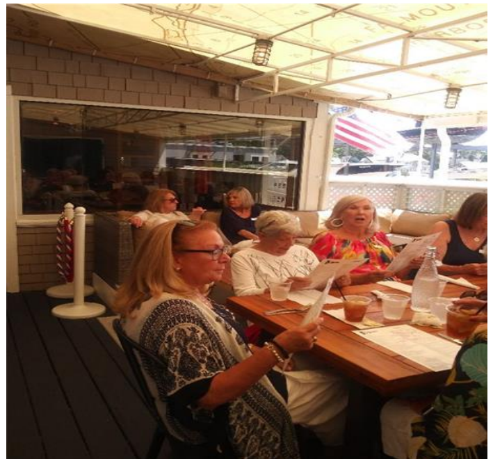
Lunch Bunchers getting together at Pier 37, Falmouth