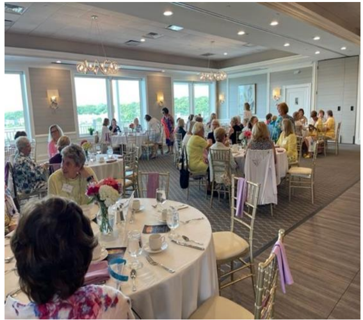
MWC Luncheon at New Seabury Country Club