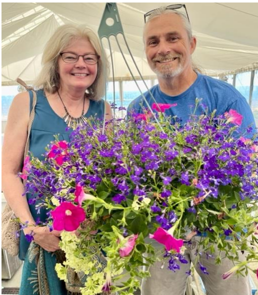
MWC is always ready to support Cape Abilities, along with enjoying their beautiful flowers.