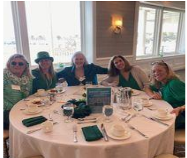
St. Patrick's Day Luncheon