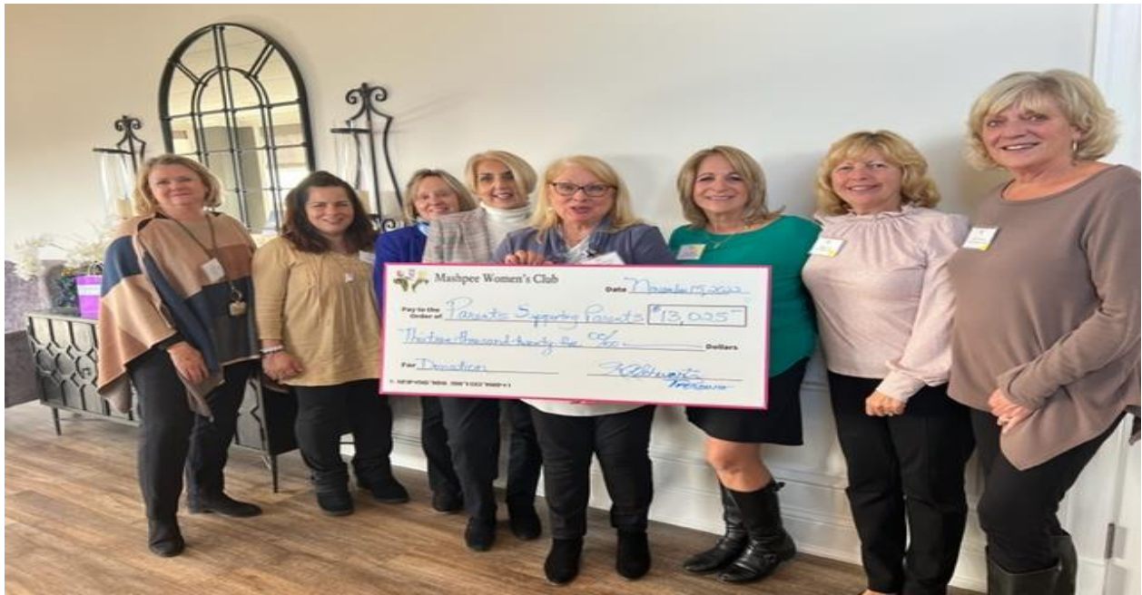
Sunset Soiree Fundraiser - MWC presenting a check in the amount of $13,025 to the Sober Living Scholarship Fund - helping so many applicants wishing to continue their recovery in safe and structured sober environment!