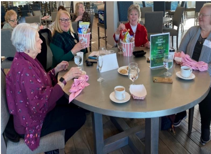
Having fun on Game Day - January