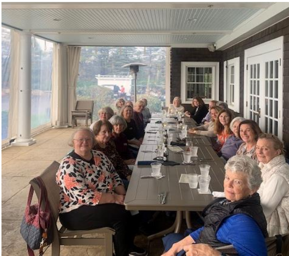
Ladies October 2022 Lunch Bunch at The Bog Tavern in Bourne