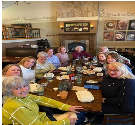
MWC Board Enjoying Lunch at Bobby Byrnes - November 2022