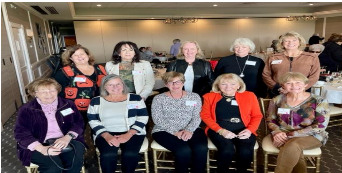
A few of our newest MWC members at the October Luncheon -Welcome!